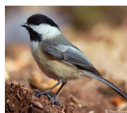
Black Capped Chickadee